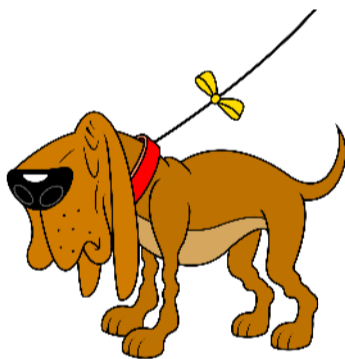
...old & grumpy.